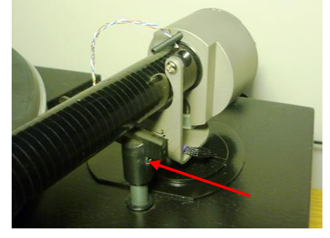
Step 2; Add The Wand armrest

Step 1; Set up the Thorens armrest height (First setting up the cartridge as per main instructions Page A) Undo the grub screw on the side of the Thorens lifter and adjust till you have the up & down settings as you like them (this is fiddly)