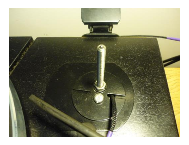
Step 5; Tighten