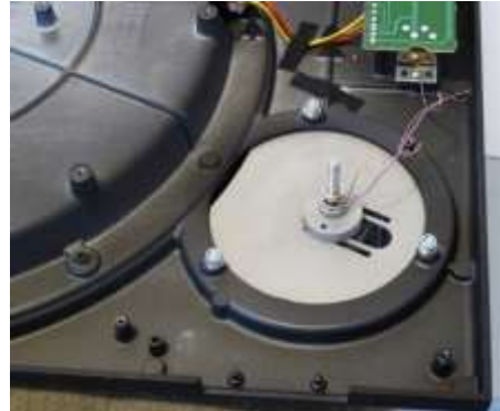
Step 7 ; Position the spindle sideways using protractor (& tighten screws)

Step 5: Screw mounting plate to turntable